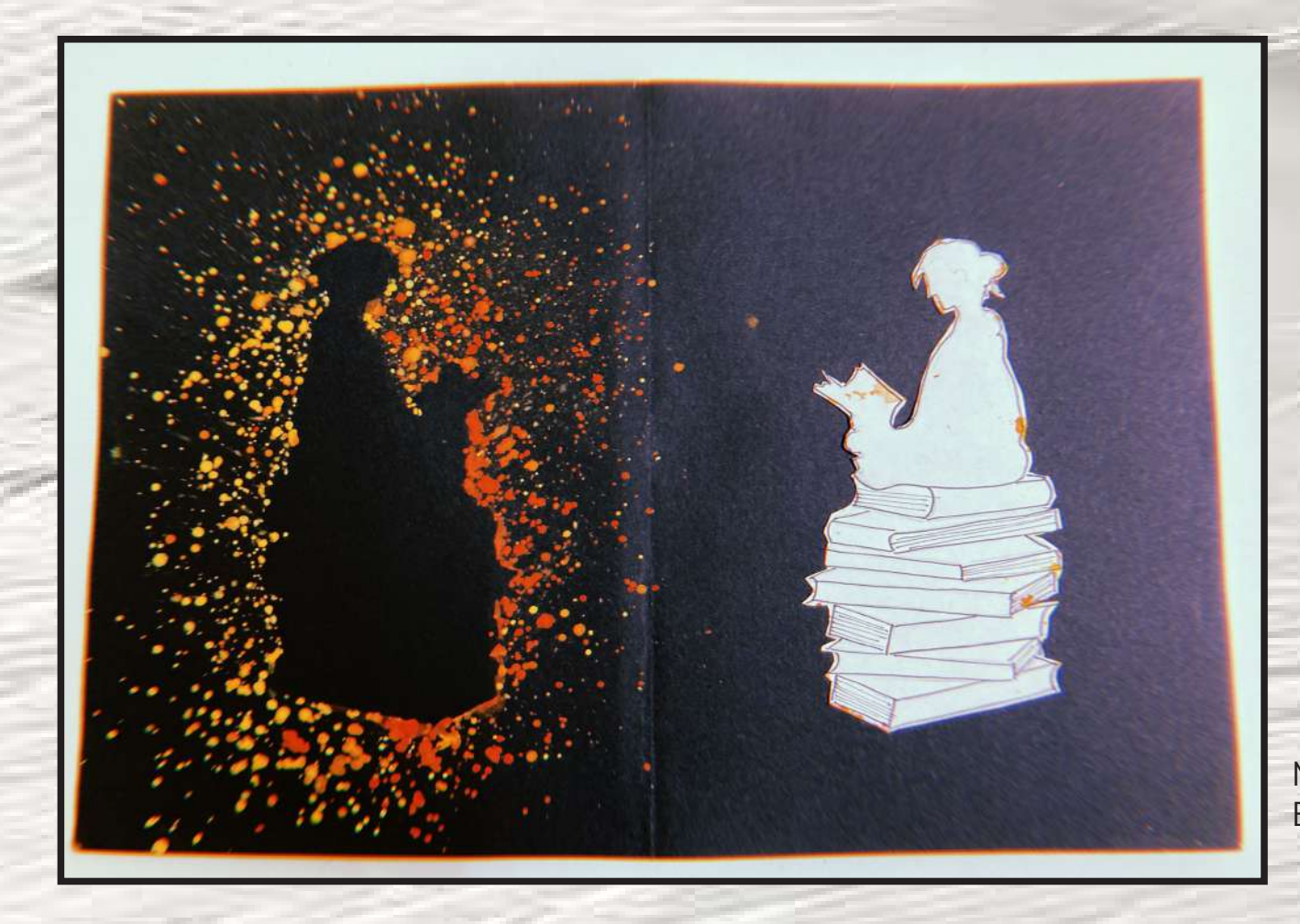
Mitalee Palwe BE EXTC